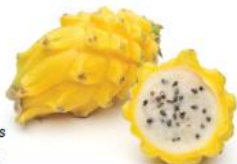
* Natural Superfoods 天然超级食品

印加果油（含有Omega脂肪酸 \omega -3, \omega -6, \omega -9）我们认为印加果油是地球上最健康的食品，它含有多种有益心脏与大脑的成分，是从亚马逊坚果印加果中冷压榨提取而来。我们正在寻找战略合作伙伴以完成超临界二氧化碳提取，它最能确保我们将来可以提取不同物质。