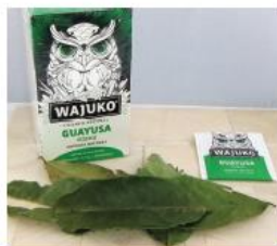
* Natural Superfoods 天然超级食品

- 冬青是一种含有咖啡因可用来生产天然功能饮料的亚马逊树叶。这种叶子已经被亚马逊印第安人使用了数百年，当昼夜工作或打猎时它可以使人保持清醒，预防疲劳与困倦。我们以散装，罐装或纸袋包装销售。