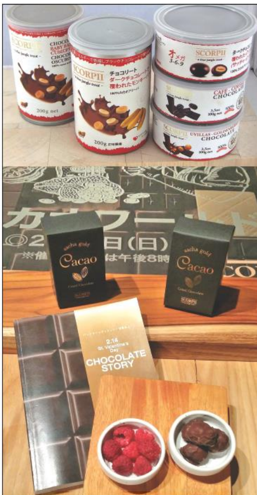
Sustainable Teak- and Balsa wood 可持续发展的柚木与巴尔沙轻木