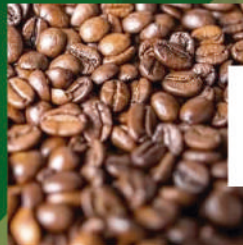
Coffee beans with chocolate