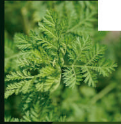
Artemisia Annua ( Artemisia absinthium )

We produce extracts, tinctures, micropulverized, and dried herbs such as Ishpingo, Guayusa, Turmeric and Artemisia Annua.