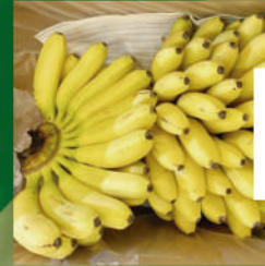
Baby Bananas with chocolate