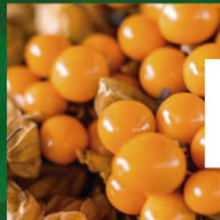
Goldenberries with chocolate