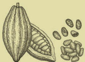
Dried fruits with chocolate