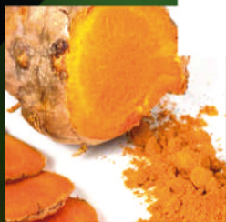
Turmeric ( Curcuma longa )

Antidepressant. It smells like cinnamon and tastes like sweet pepper. Relaxing properties.