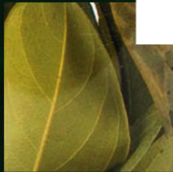
Ishpingo ( Ocotea quixos )

Contains more caffeine than coffee. Energizing properties. Anti-oxidant It is good for your digestion, immune system, and vascular system. It also cleans the teeth, improves your energy levels, and is useful for weight loss.