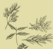
Dried, Extract & Powder