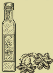
Sacha Inchi Oil and nuts