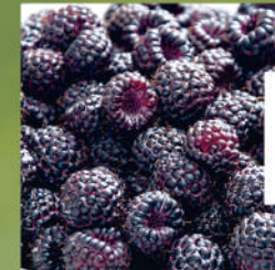
Blackberries with chocolate