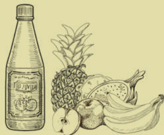
Tropical fruit vinegars