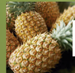
Pineapple with chocolate