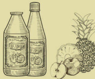
Tropical fruit juices