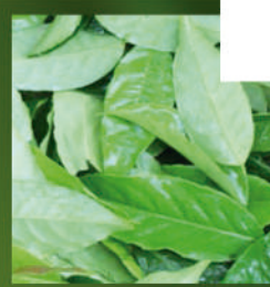
Guayusa ( Ilex guayusa )

This plant won the Nobel Prize in Physiology - Medicine in 2015. It is the cure of malaria! It also helps the immune system and acts like an anti-viral and stabilize cancer patients.